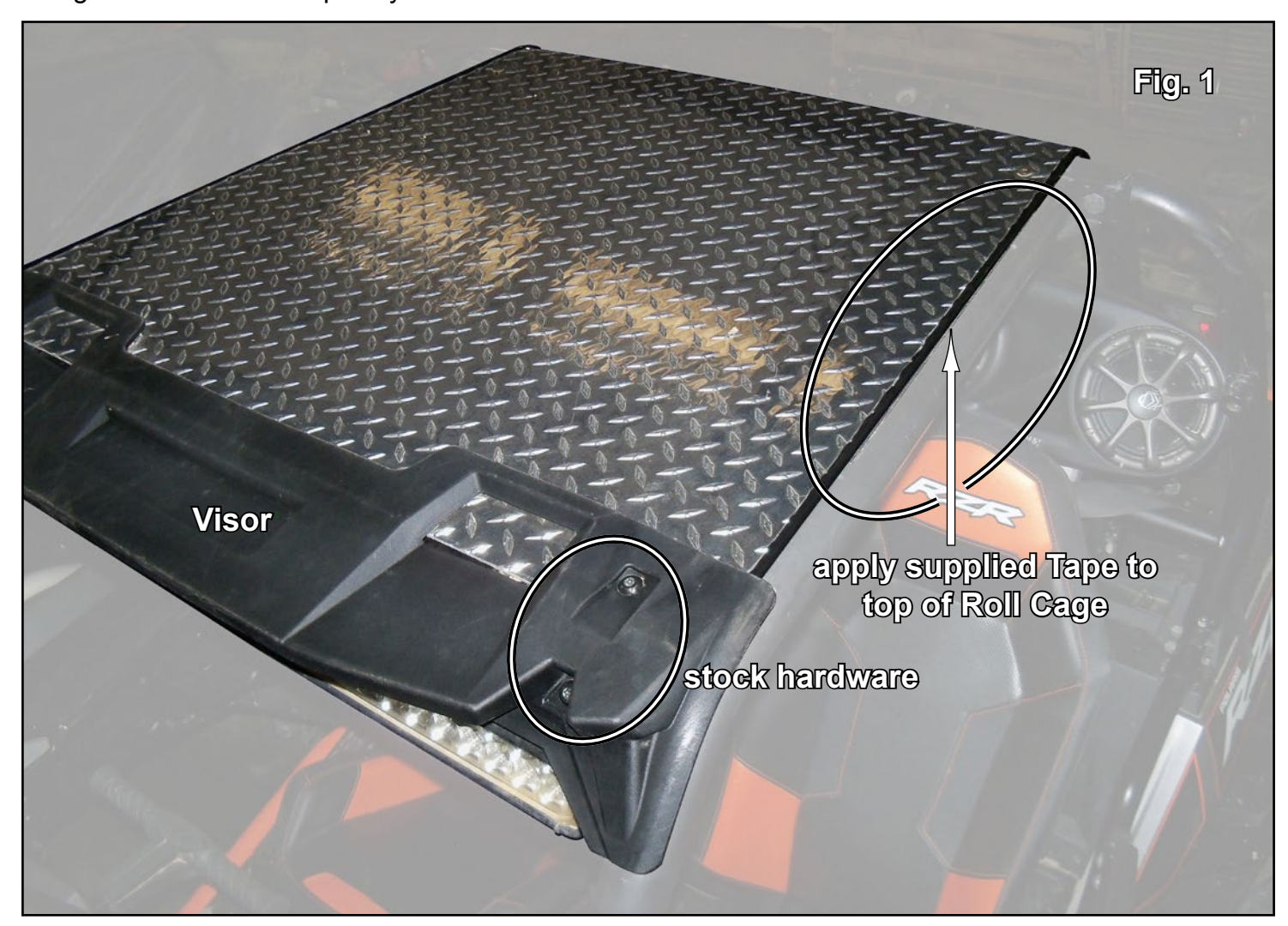
(installation illustrations on following page)