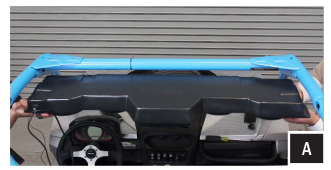
A. With one person on either side of the vehicle place the WP-CM04 into location from the underside of the cage.